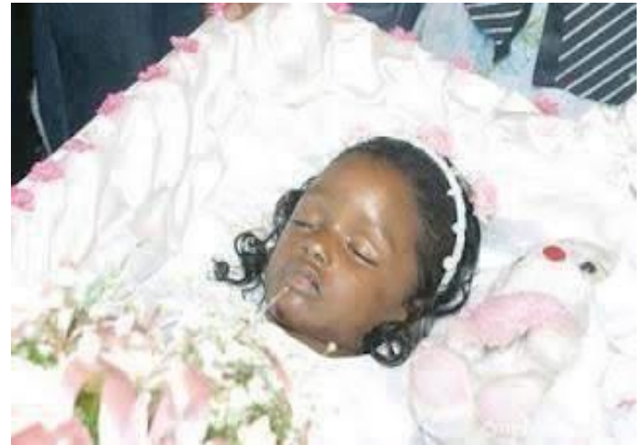
Victim of a stray bullet

More laws and more police ALONE will NOT stop gun violence! We must STRENGTHEN FAMILIES!